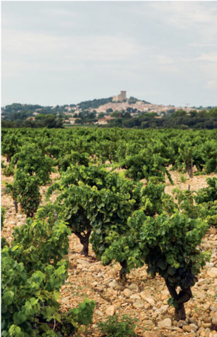
The Châteauneuf-du-Pape vineyards of Domaine Giraud yielded stunning wines in the exceptional 2016 vintage, producing three classic-rated reds that offer gorgeous flavors and seductive mouthfeel.

Compared with the south, which saw near idyllic weather all season long in 2016, the north got off to a late start due to a wet and cloudy spring. Flowering ran two to three weeks behind schedule and coulure was rampant through the valley, resulting in a lower crop yield. Hermitage was hit by hail in April, reducing its crop size further. But from the end of July through September, the weather